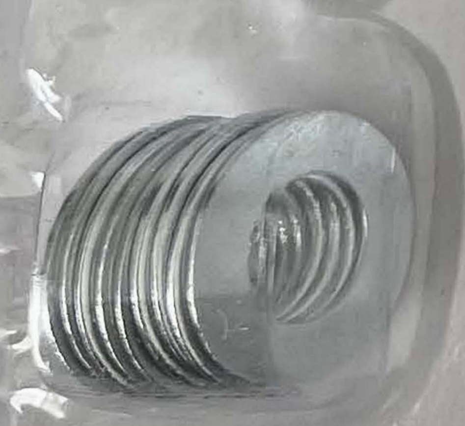
#5 and #8 large M8 - 8mm Flat Washer (9PCS)