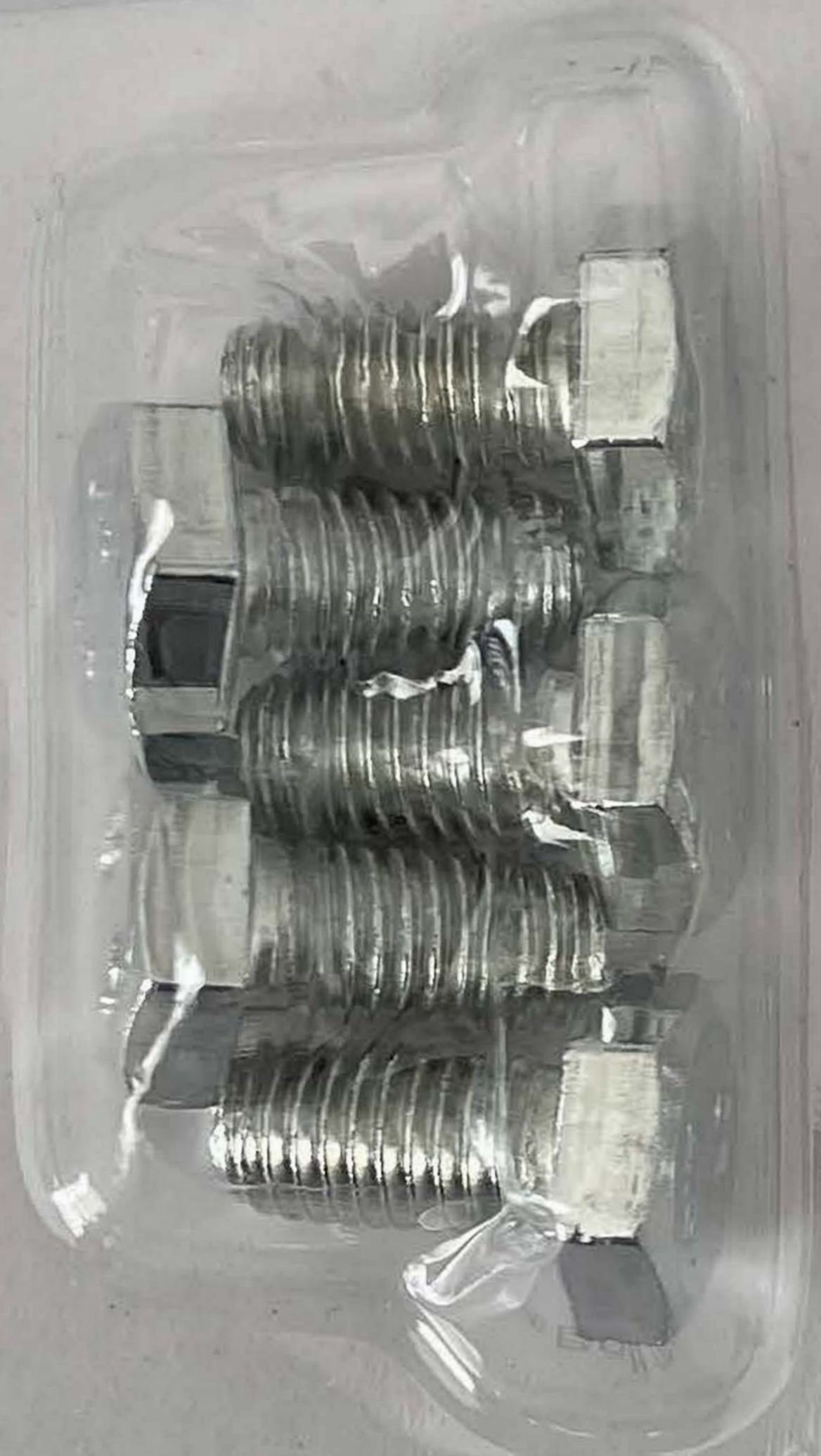
#1 and #2 Medium Bolt M8 - 16mm (5PCS)