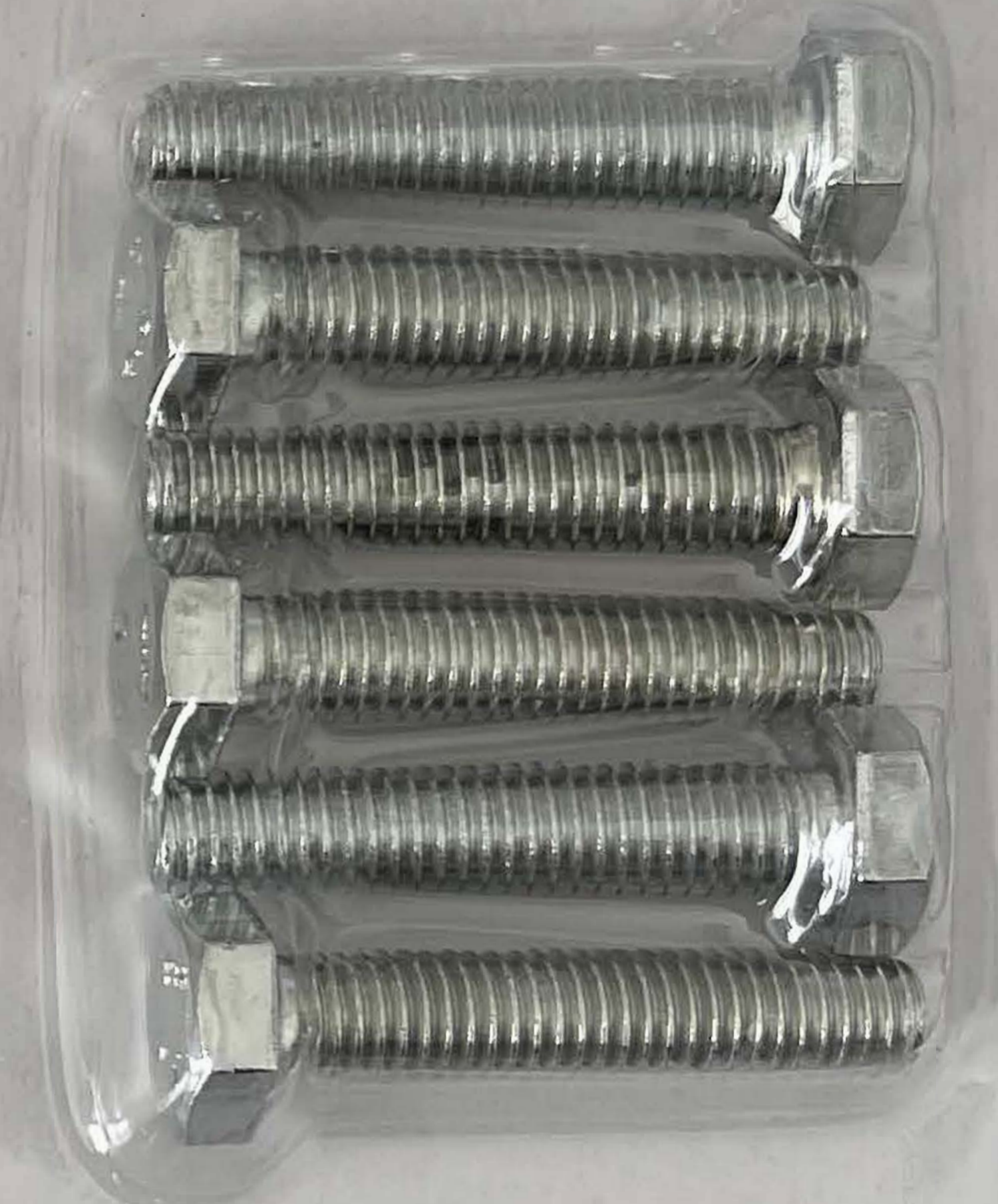
#3 M6 -30mm Large Bolt (6PCS)