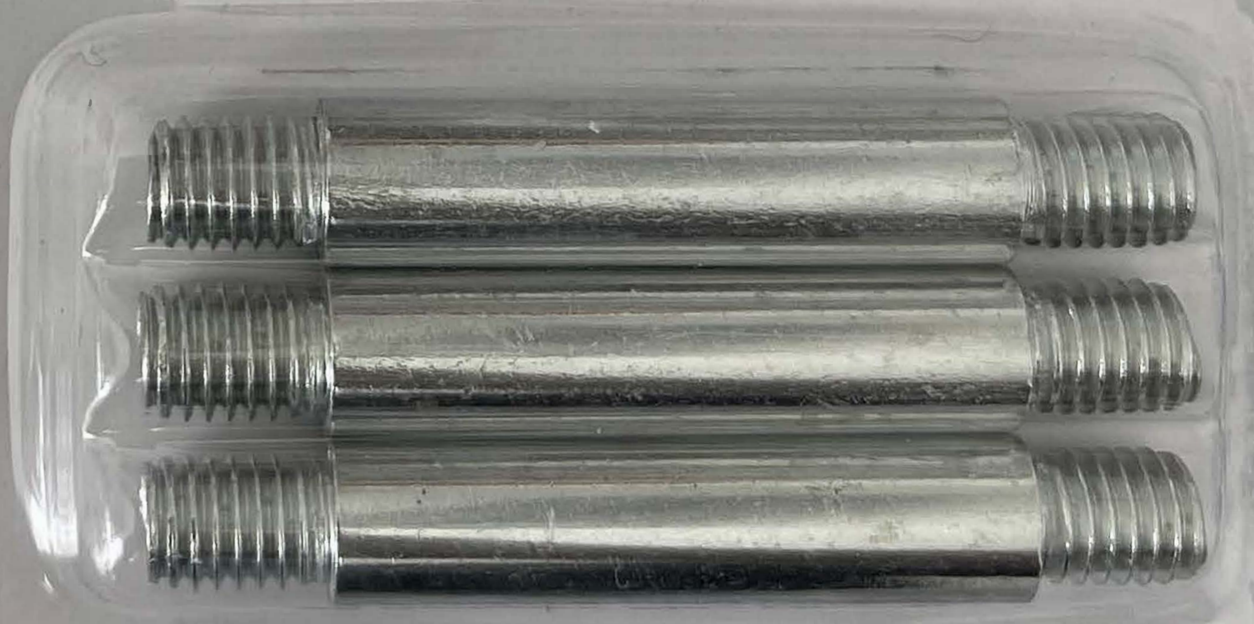
#5 Reflector Stud M8 - 90mm (3PCS)