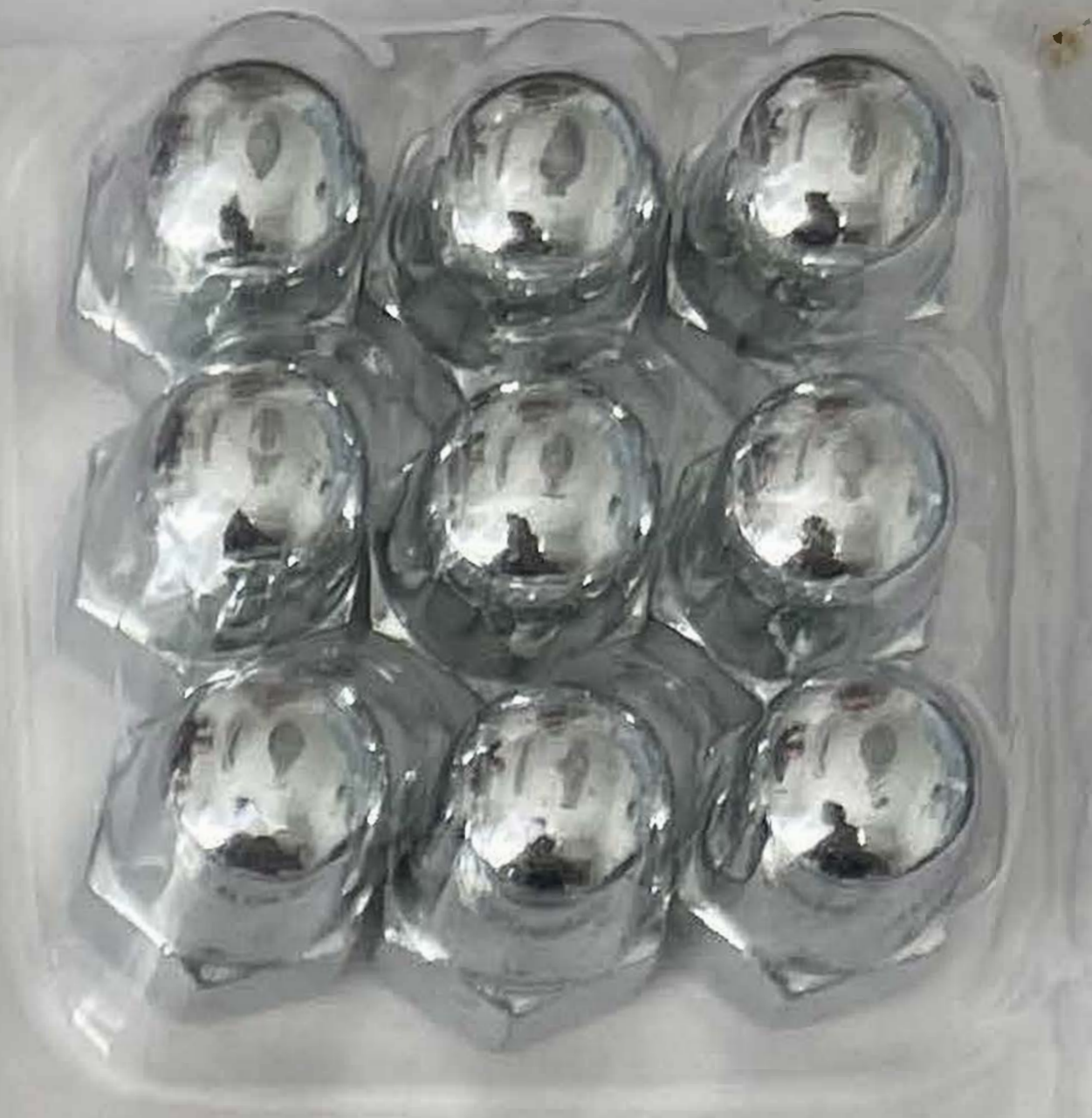
#7 Cap/Castle M8 Nut(9PCS)