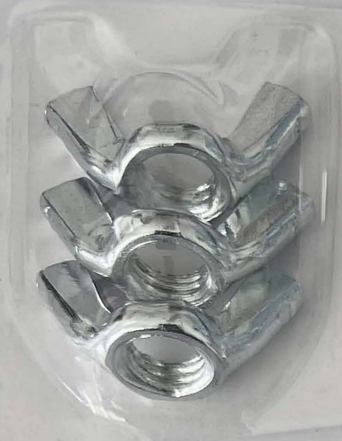
#8 Wing Nut M8 (3PCS)