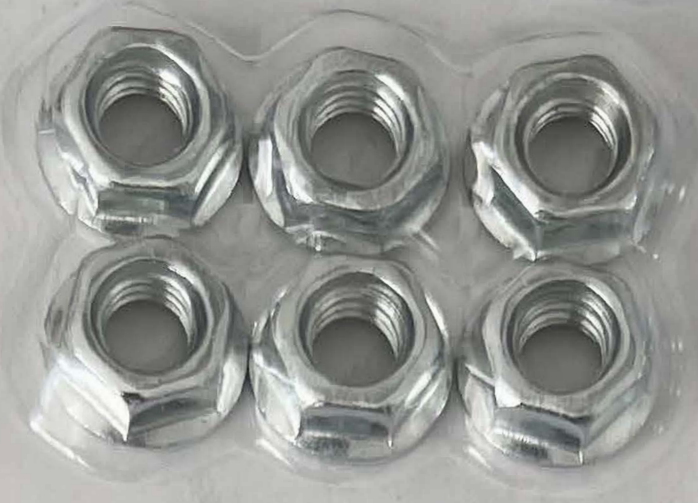
#3 Small Flange M6 Nut (6pcs)