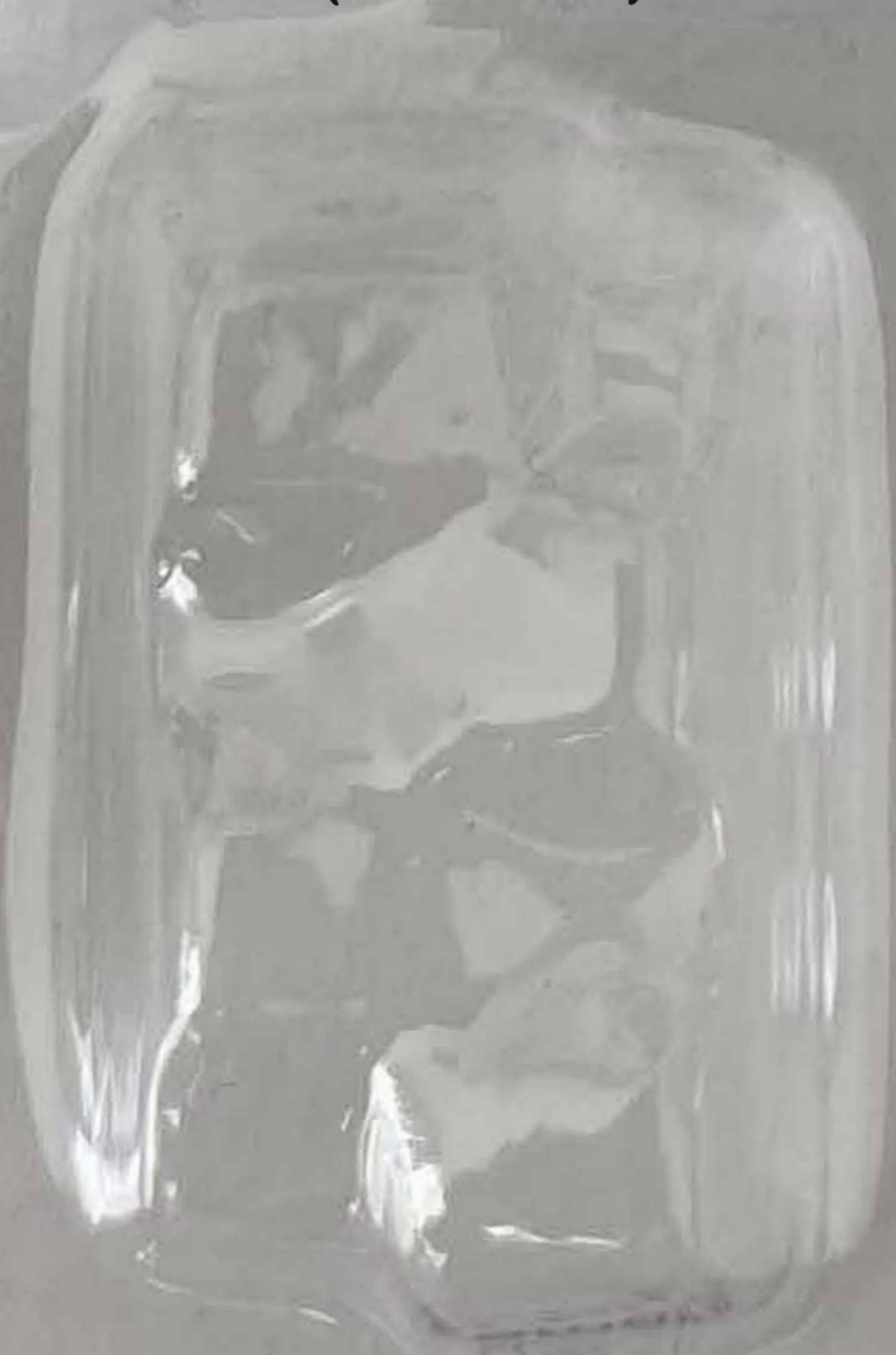
#6 Small Bolt and Lock Washer (4 pcs) Pre-assembled in Head Assembly