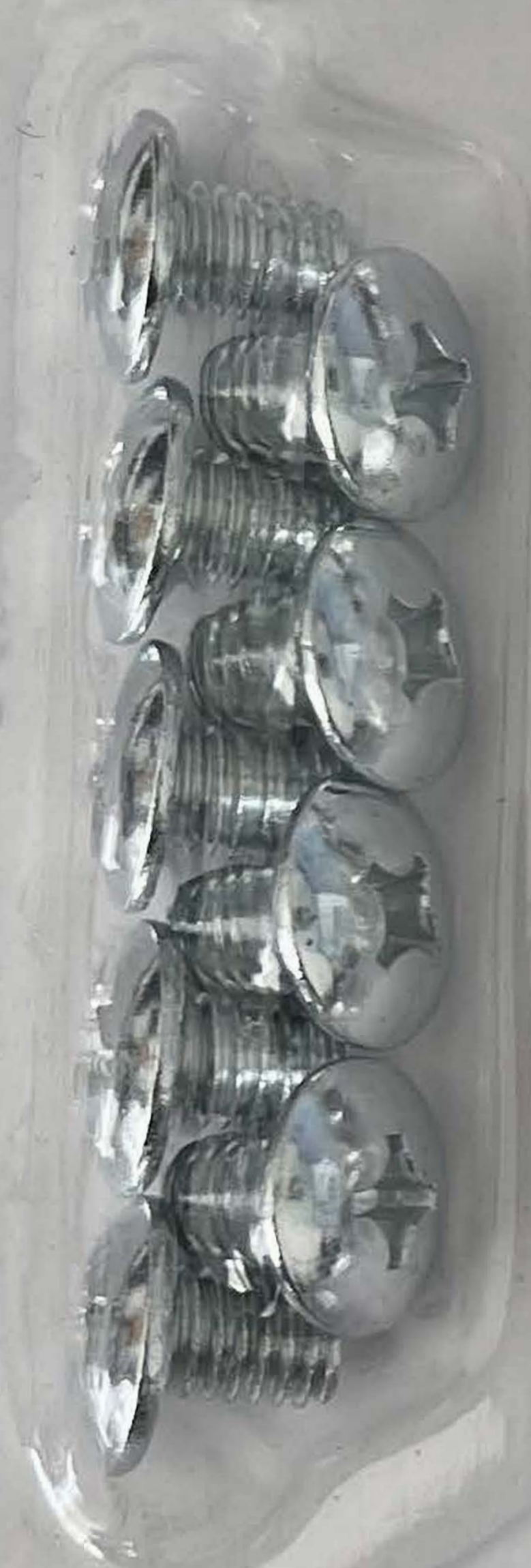
#7 Small M6 - 12mm Screw (9PCS)